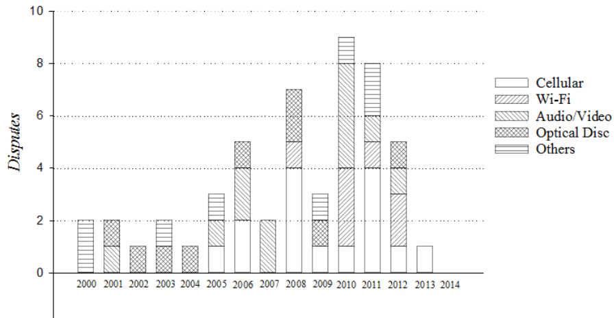
Figure 2. Cumulative Statistics of the Technological Areas

Figure 2 presents cumulative statistics of the technical areas for each year based on the dates of filing. The disputes regarding cellular communications standards arose during two periods: from 2005 to 2006 and from 2008 to 2013. One possible reason for the former period of disputes may lie in the success of W-CDMA/HSPA standards and fierce competition in relevant markets. The later period was supposed to be driven by the explosive growth of smartphones and was part of the so-called smartphone patent wars. 45 The disputes in audio and video coding standards were normally distributed in these years. Likewise, the disputes in optical disc standards were normally distributed while the contents of disputes had changed from CD, to DVD, to Blu-ray standards. The disputes in Wi-Fi network standards arose mainly between 2010 and 2012.