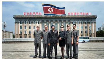
北韓搖滾解放日 Liberation Day