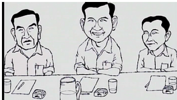
最後的共產黨員 The Last Communist