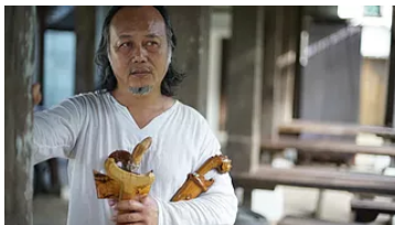
海城遊記 Voyage to Terengganu