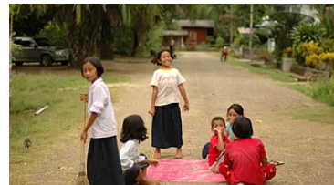
村民收音機 Village People Radio Show