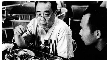
大榴蓮 The Big Durian