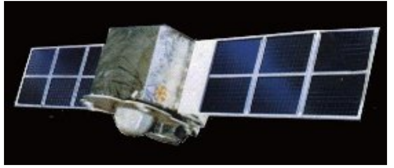
Figure 7: Feng Yun -1C Satellite Source:

This study will seek to both link and expand upon the available literature, viewing China's militarization of space from the system, national/strategic and domestic levels in order to achieve a more nuanced and realistic interpretation of China's military space program, and the PRC's ASAT testing in particular. In order to do so, this study will draw upon the above-mentioned works as well as a number of other works which focus on China's military space program, the militarization of space, China's security diplomacy, and China's unique party-military relations. Having discussed the current literature, let us now move to the subject of China's military space program.