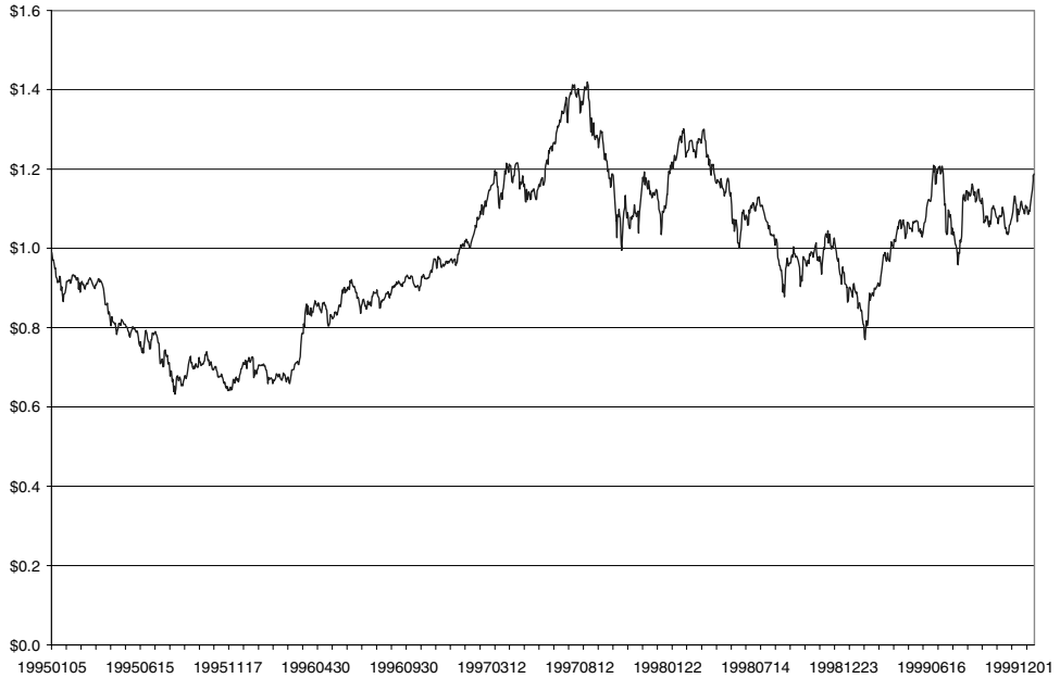
Fig. 1. Growth of $1 invested in Taiwan Index on 31 December 1994.

1995 to 1999 – growing from NT$ 5.2 trillion (US$ 198 billion) in 1995 to over NT$ 10 trillion (US$ 313 billion) in 1999. 3 At the end of 1999, the Taiwan market ranked as the 12th largest financial market in the world, though it was only slightly greater than 2% of the total US market.